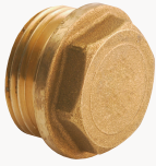
Brass Plug Male Thread (Parallel)