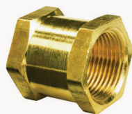
Straight Coupler Female x Female Thread