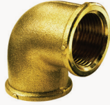
Female Elbow Female x Female Thread