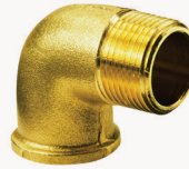
Male x Female Elbow Male x Female Thread