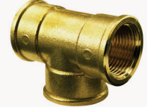
Tee - Equal Female Thread All Ends