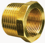
Reduced Bush Male x Female Thread