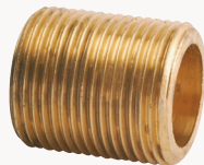
Running Nipple Male (Parallel)