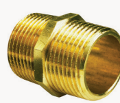
Hexagon Nipple Male x Male Thread